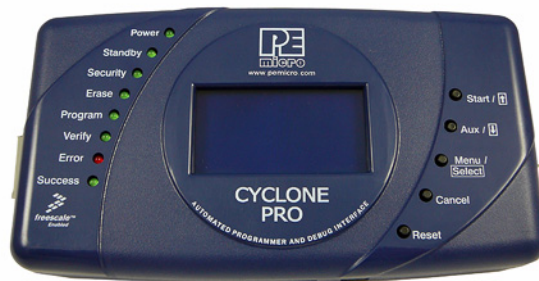
P&E’s Cyclone PRO

The USB BDM MULTILINK is intended for development and is not designed to accommodate the demands of production programming. However, P&E’s Cyclone programmers are specifically engineered to withstand the rigors of a production environment and will provide a seamless transition from the USB BDM MULTILINK. More information is available at: http://www.pemicro.com/cyclone